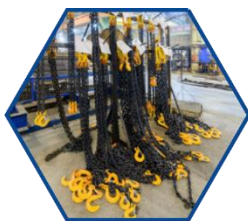
TESTING & CALIBRATION